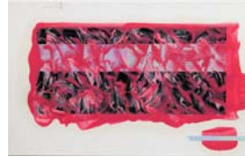
Color Study #27, 2009